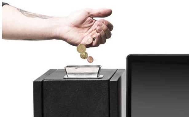
Accepts and checks up to 6 coins per second