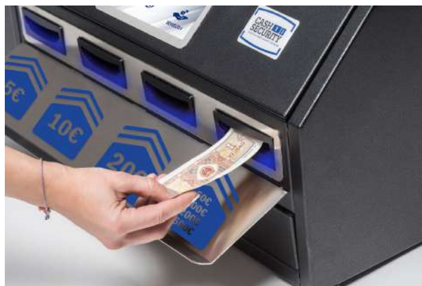
Multi-currency, accepts and verifies all bills