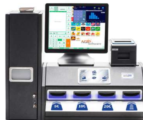
Suitable with all software on the market and all platforms