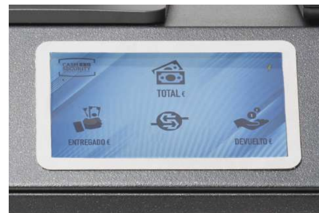
Integrated high-brightness display