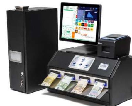
Accepts and verifies multiple bills simultaneously