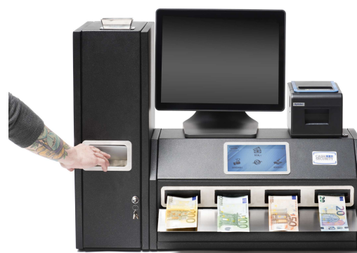
Return 15 coins per second